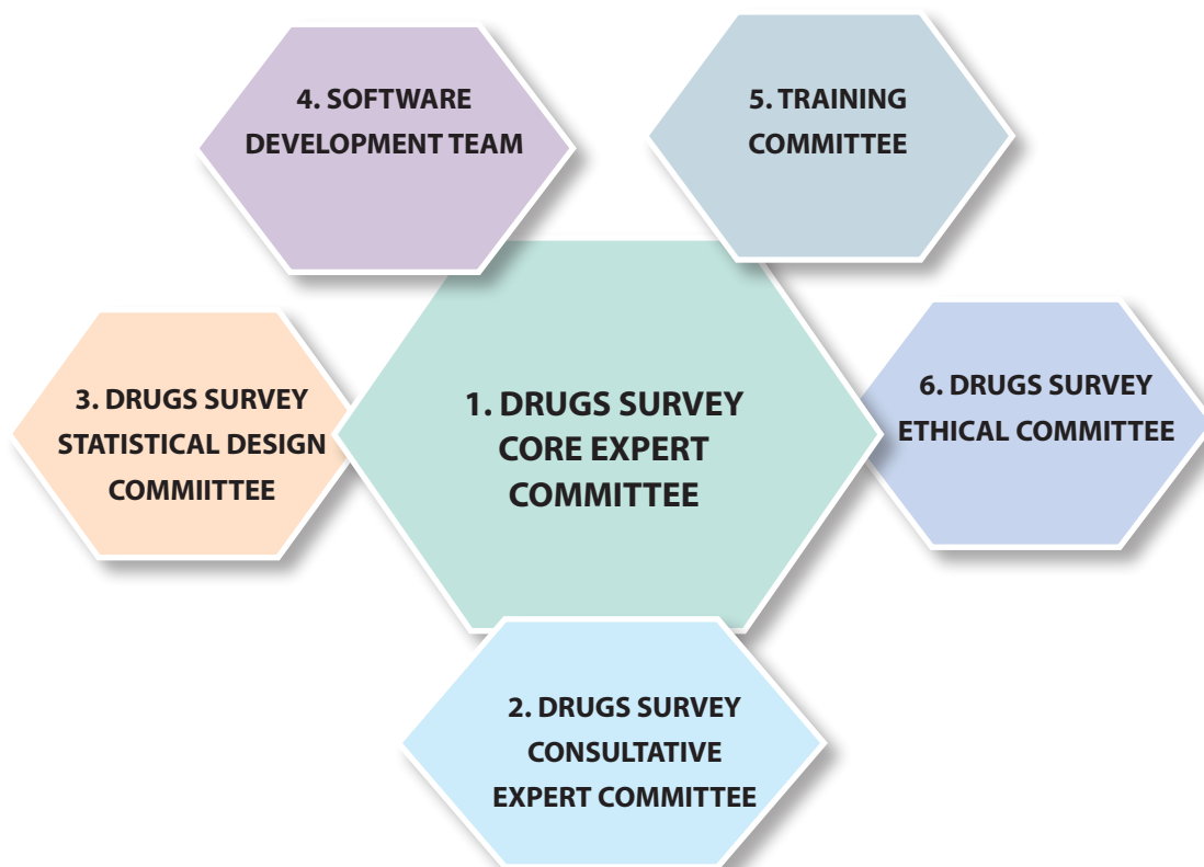
Exhibit 4.1 Major Committees of Drug Survey

The conceptualisation, conduct and coordination of the Survey was carried out by the eminent experts from both public and private sectors. The apex body known as the Drugs Survey - Core Expert Committee's role was planning and designing of the study, preparation of guidance document, preparation of checklist and identification of representatives of Civil Society /Pharmacy Council of India. The Committee also undertook training of Central and State Drug Inspectors and representatives of Civil Society /Pharmacy Council of India. The Core Expert Committee was supported by the Drugs Survey - Consultative Expert Committee. The Drugs Survey - Statistical Design Committee approved the statistical design for Drug sampling. The Drugs Survey - Ethical Committee looked into test and analysis reports of the Drug Survey samples.